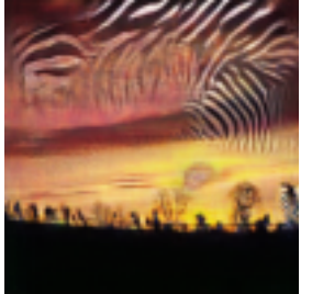
P_{0.5}(w) \rightarrow Q_{12}(w, f)