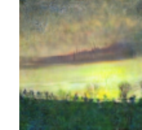
Q_{12}(w, f) \rightarrow P_{0.5}(w, f)